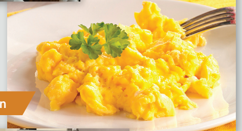
Branded Egg Station