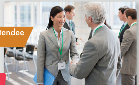
First-Time Attendee Prize