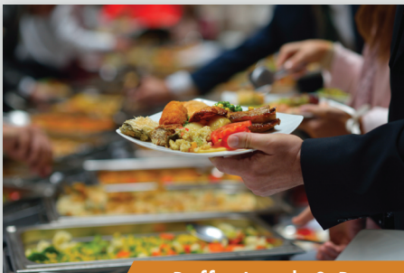
Buffet Lunch & Bag