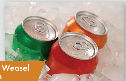
Pop Goes the Weasel Station