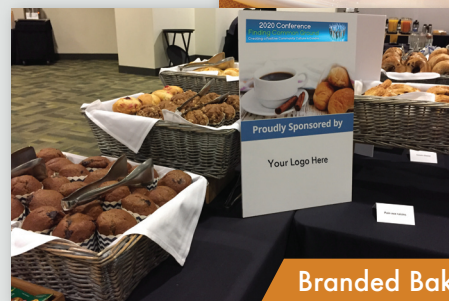
Branded Bakery Station