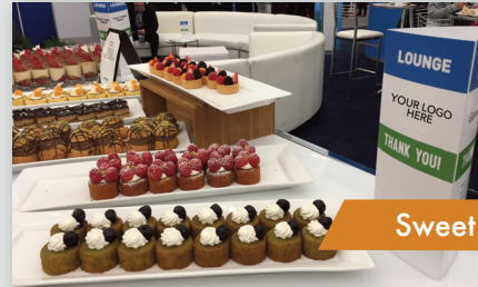
Sweet Tooth Break