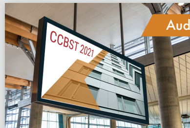
Audio Visual Sponsor