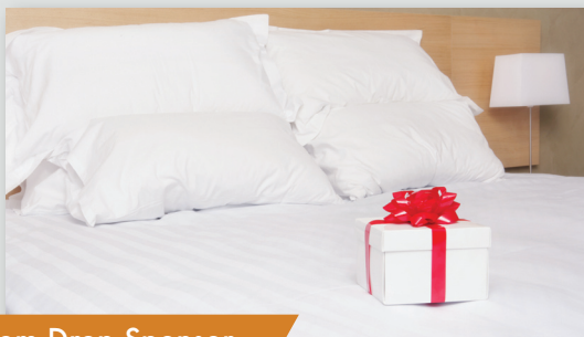
Room Drop Sponsor